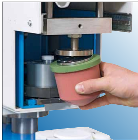
Toolless printing pad change