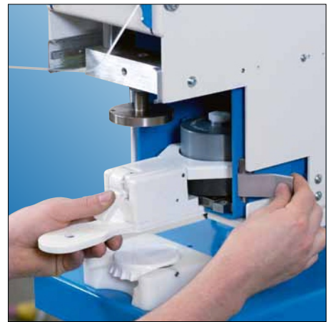
Toolless cliché change